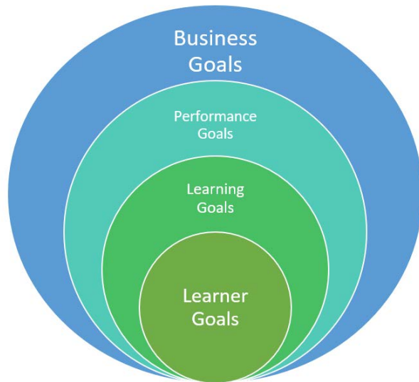
Figure 1 – Instructional design priorities for training interventions.